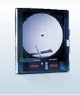
Chart Recorders: for hard copies of all process activities

West Instruments distributes a wide range of Partlow brand digital (microprocessor based) and analogue circular chart recorders. The range provides reliable operation in rugged environments – from light industrial through to extreme industrial wet applications to industry specific flow and relative humidity applications.